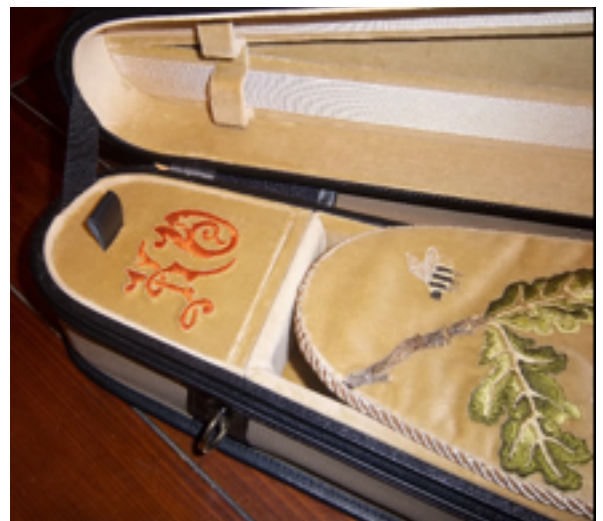
Shaped Model - Interior Pocket Case by T. A. Timms & Son; Embroidery by Janice Gail