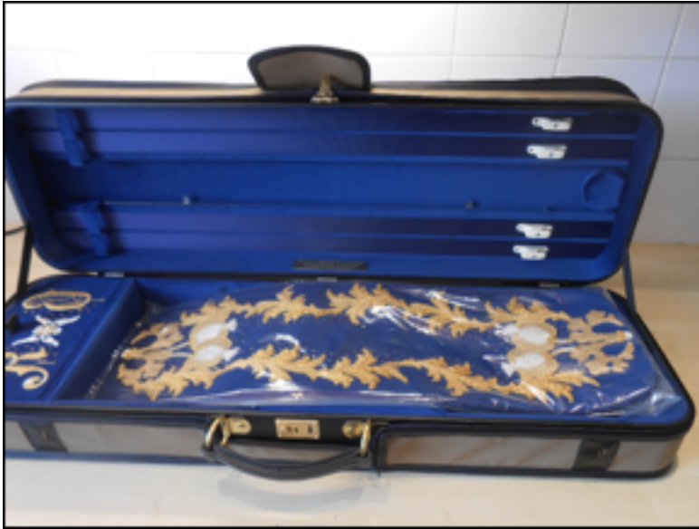
English Style (Oblong) Model - Interior with Blanket in Protective Plastic Case by T. A. Timms & Son; Embroidery by Janice Gail