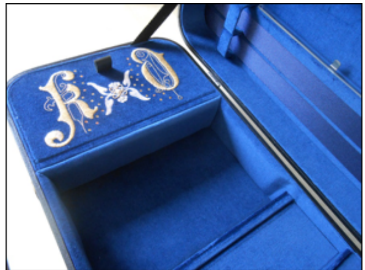
English Style (Oblong) Model - Interior Pocket Case by T. A. Timms & Son; Embroidery by Janice Gail

I ordered two cases - a shaped case for plane travel and an English model (or oblong) for daily use. Desmond asked me to provide tracings and measurements of my violin, so that the case shells could be built to size. I was also able to customize the features of each case, including choosing fabric colors, music pockets, and adding special "D" rings so I could wear them as a backpack. Finally, Desmond allowed my mother, an incredibly talented fiber artist, to create unique needlework designs on the interior fabric.