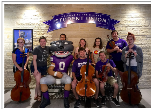
Some K-State string students eager to welcome your students to String Fling!

MOTELS: Negotiations are under way with some nearby motels for blocks of reduced rate rooms for Saturday night. Check the website for information in early October!