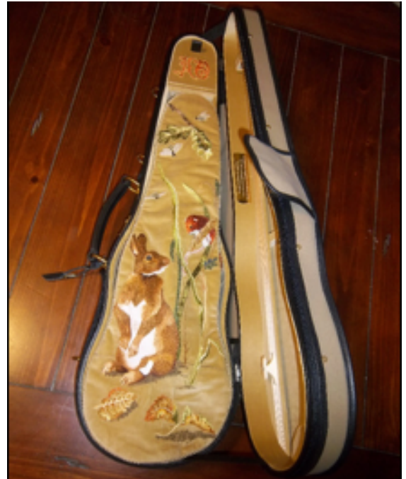
Shaped Model - Interior with Blanket Case by T. A. Timms & Son; Embroidery by Janice Gail