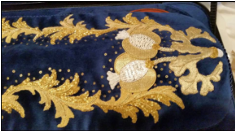
English Style (Oblong) Model - Interior Blanket Case by T. A. Timms & Son; Embroidery by Janice Gail